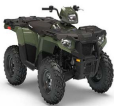
ATV SPORTSMAN 570 $15.00 ticket

We need your help to make this fundraiser a success for our parish, please consider buying tickets for this raffle/fundraiser.